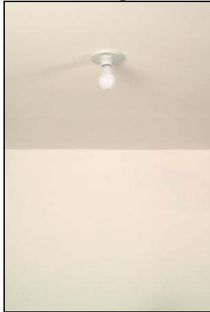
Standard Light – Before