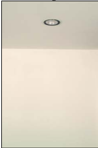
Recessed Light – Before